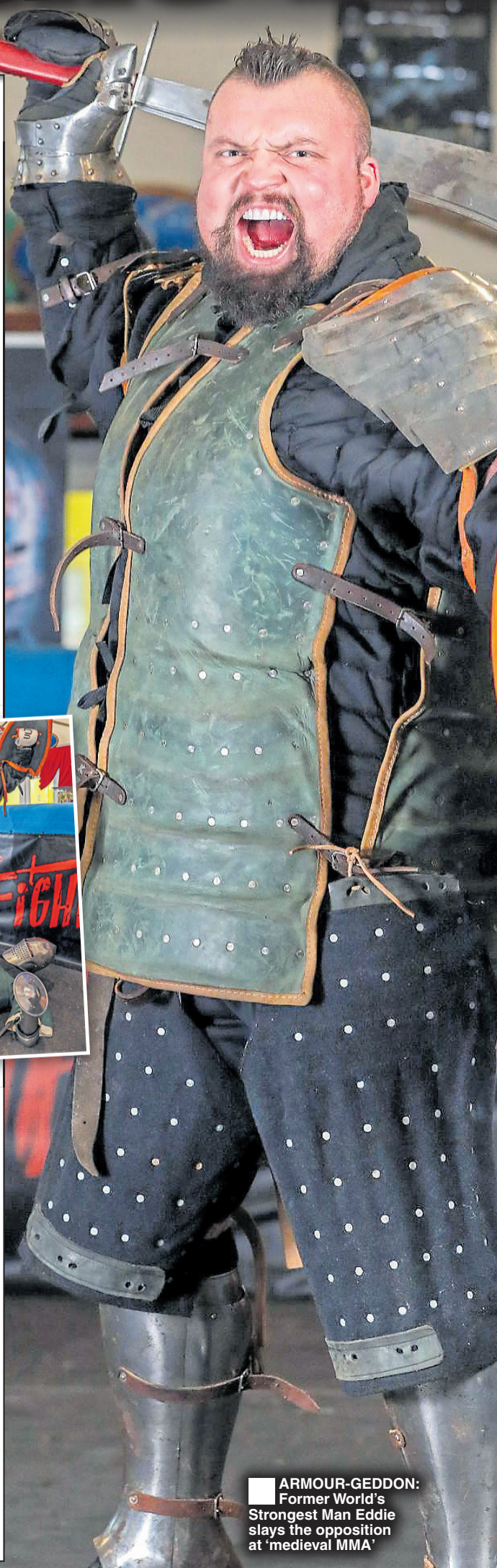
ARMOUR-GEDDON: Former World's Strongest Man Eddie slays the opposition at 'medieval MMA'